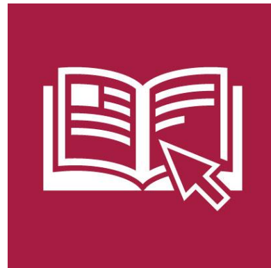
Self-Paced Online Classes