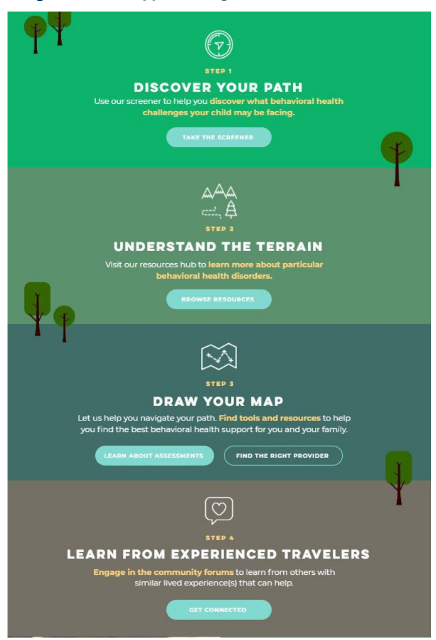
Image 2: BH360 supports caregivers at all intersections of the behavioral health journey

This image is a screenshot of BH360, currently in a prototype state. This shows how BH360 helps guide caregivers (parents) along their respective behavioral health wellness journey.