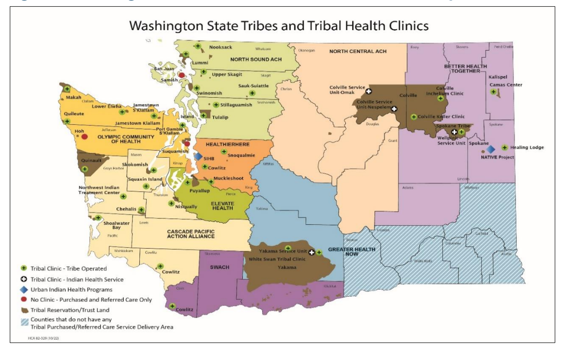
Figure 2: ACH regions and Tribes and tribal health clinics map

ACHs operate under the Tribal Consultation & Communication Policy that was established under the original Medicaid waiver. Tribal participation varies across the state. This report reflects the varied levels of engagement among the tribes and the nine ACHs.