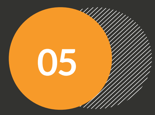
Language development support for providers