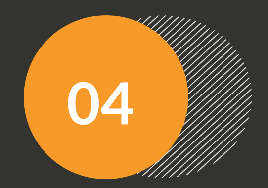
Support for Community-Based Organizations