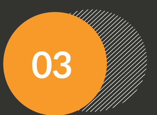
Expand Medicaid reimbursement for clinicians serving children in _____childcare settings