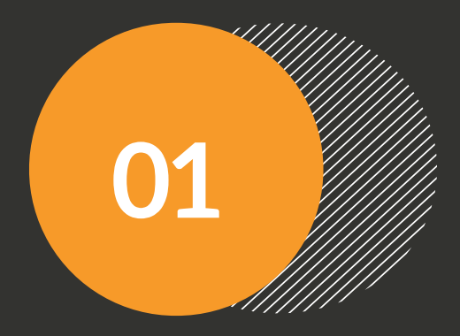
Build on outdoor preschool initiative