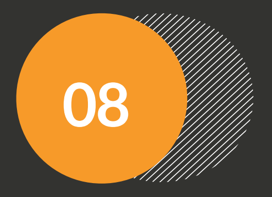
Maternal Eligibility in HB 1045