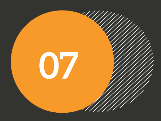
Guaranteed Basic Income