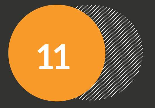
Community Health Workers