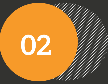
Expand Medicaid reimbursement