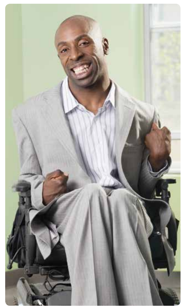
HCA 22-850 EN (7/14) English

Use 'Health Home' services to improve your life by coordinating your health and social services.