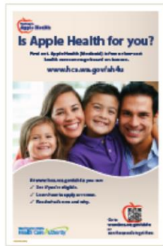
Is Apple Health for you? Find out.