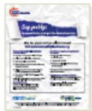
Manage your Apple Health coverage online

Go to the HCA publications website at www.hca.wa.gov/free-or-low-cost-health-care/forms-and-publications . You are encouraged to print what you need from the website. Small quantities are available for ordering in English. Other languages are available for downloading from the website.