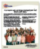
Share your Apple Health story