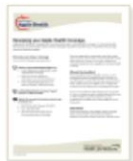
Renewing your Apple Health coverage