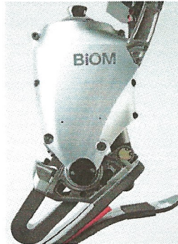
Powered Plantar Flexion replicates the work of muscles and tendons. It is the transformation point where prosthetics become bionics.

A person with an amputation no longer has to adjust their gait cycle to manage the weight of the prostheses. The BiOM powered plantar flexion replicates muscles and tendons and contributes to propulsion of the device as well as center body mass.