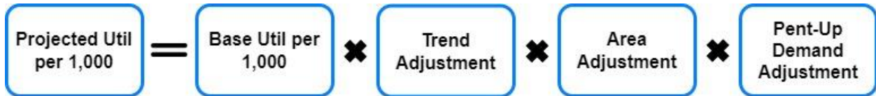
Figure 3 - Projected Unit Cost Formula