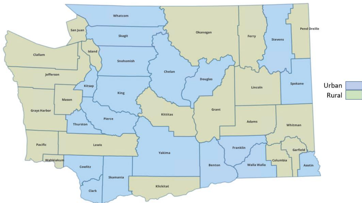
Figure 1 – Urban vs Rural Counties in Washington State