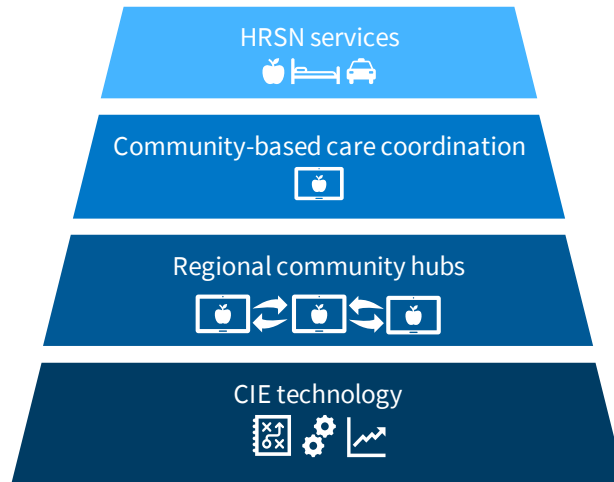
Figure 1: The foundations of delivering health-related social needs services

delivery of HRSN services, such as nutrition, housing, and transportation by community-based organizations. HCA is proposing the CIE program to meet the immediate and long-term needs of CIE technology throughout Washington State. CIE technology, as shown in Figure 1, is integral for scaling the delivery of health-related social needs (HRSN) services as proposed in MTP 2.0.